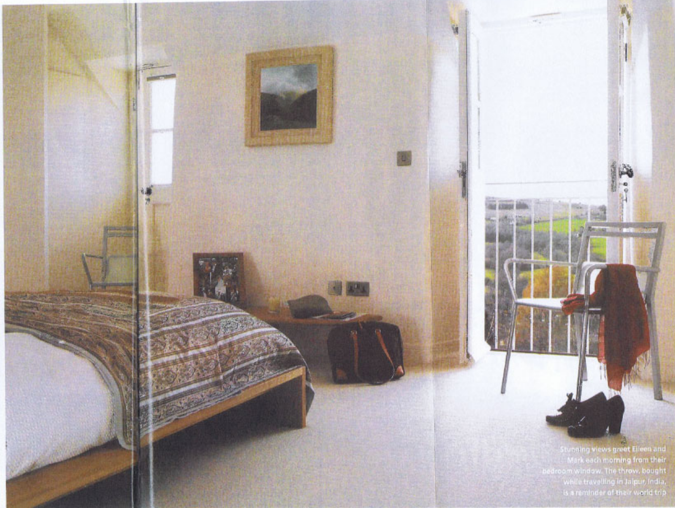
Stunning views greet Eileen and Mark each morning from their bedroom window. The throw, bought while travelling in Jaipur, India, is a reminder of their world trip