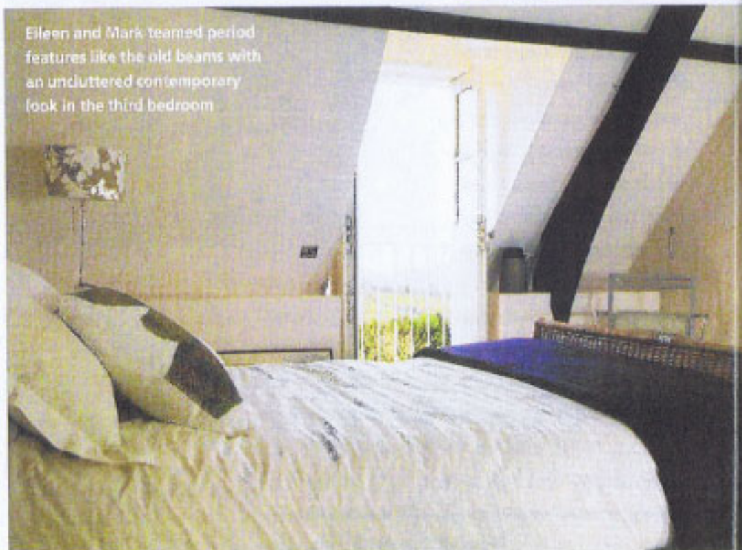
Eileen and Mark teamed period features like the old beams with an uncluttered contemporary look in the third bedroom