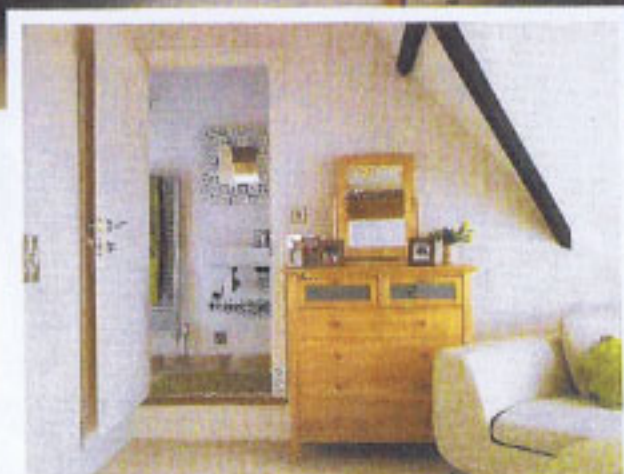
Left Visitors often remark on the striking Marks and Spencer mirror in the guest room's ensuite, which follows the green colour theme. The wooden chest of drawers is from John Lewis