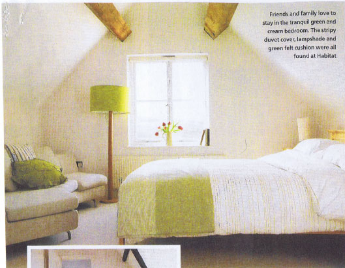
Friends and family love to stay in the tranquil green and cream bedroom. The stripy duvet cover, lampshade and green felt cushion were all found at Habitat